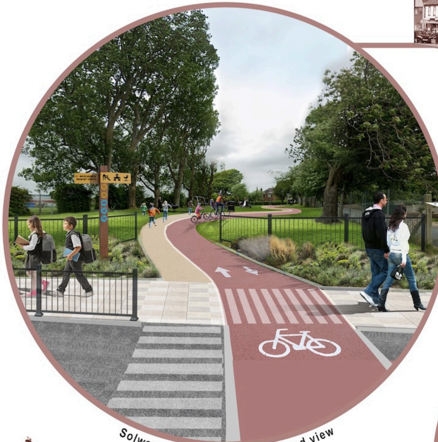
Solway St cycle route playground view