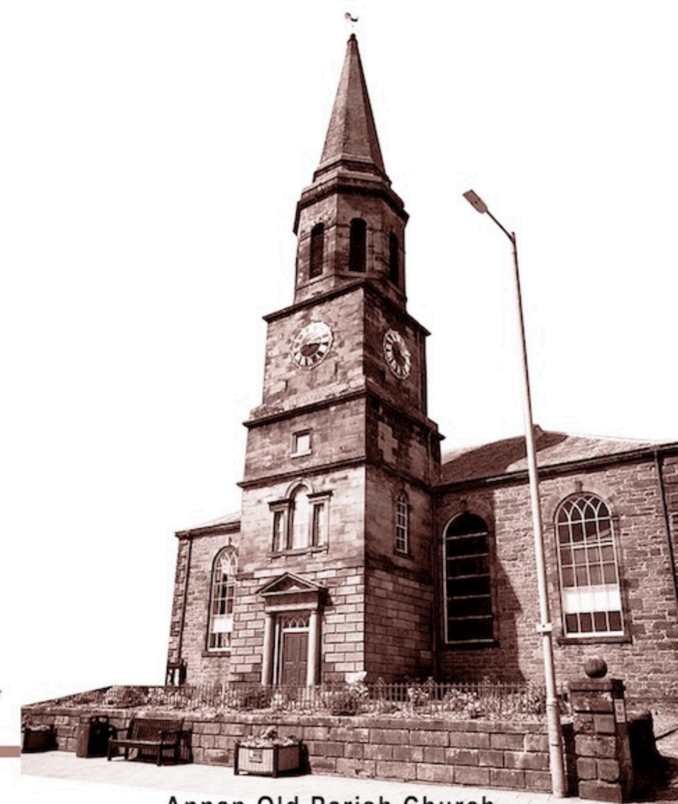
Annan Old Parish Church