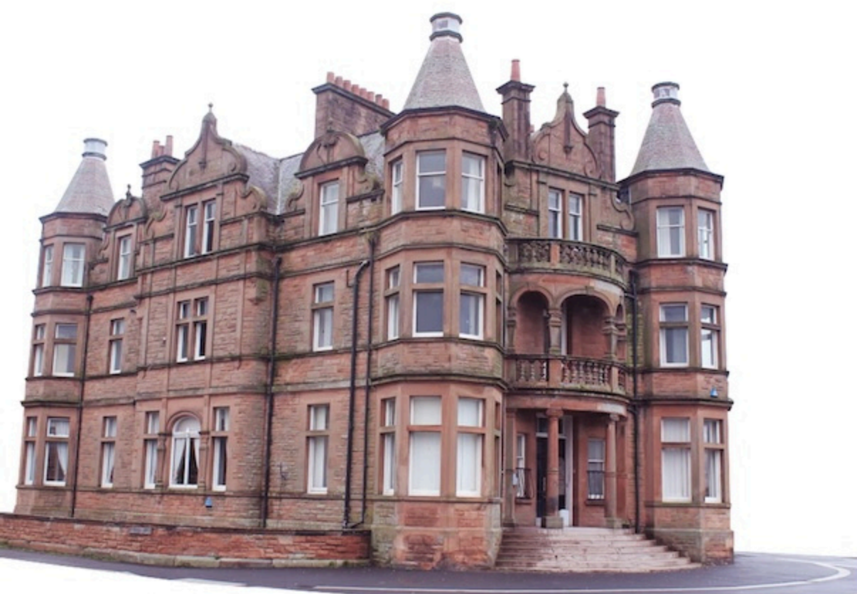
Central Hotel, Annan