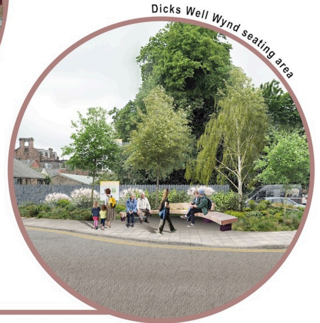
Dicks Well Wynd seating area