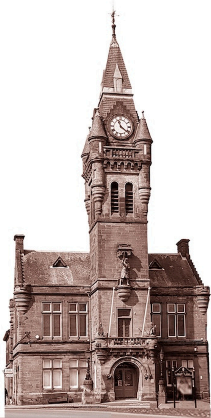
Annan Town Hall