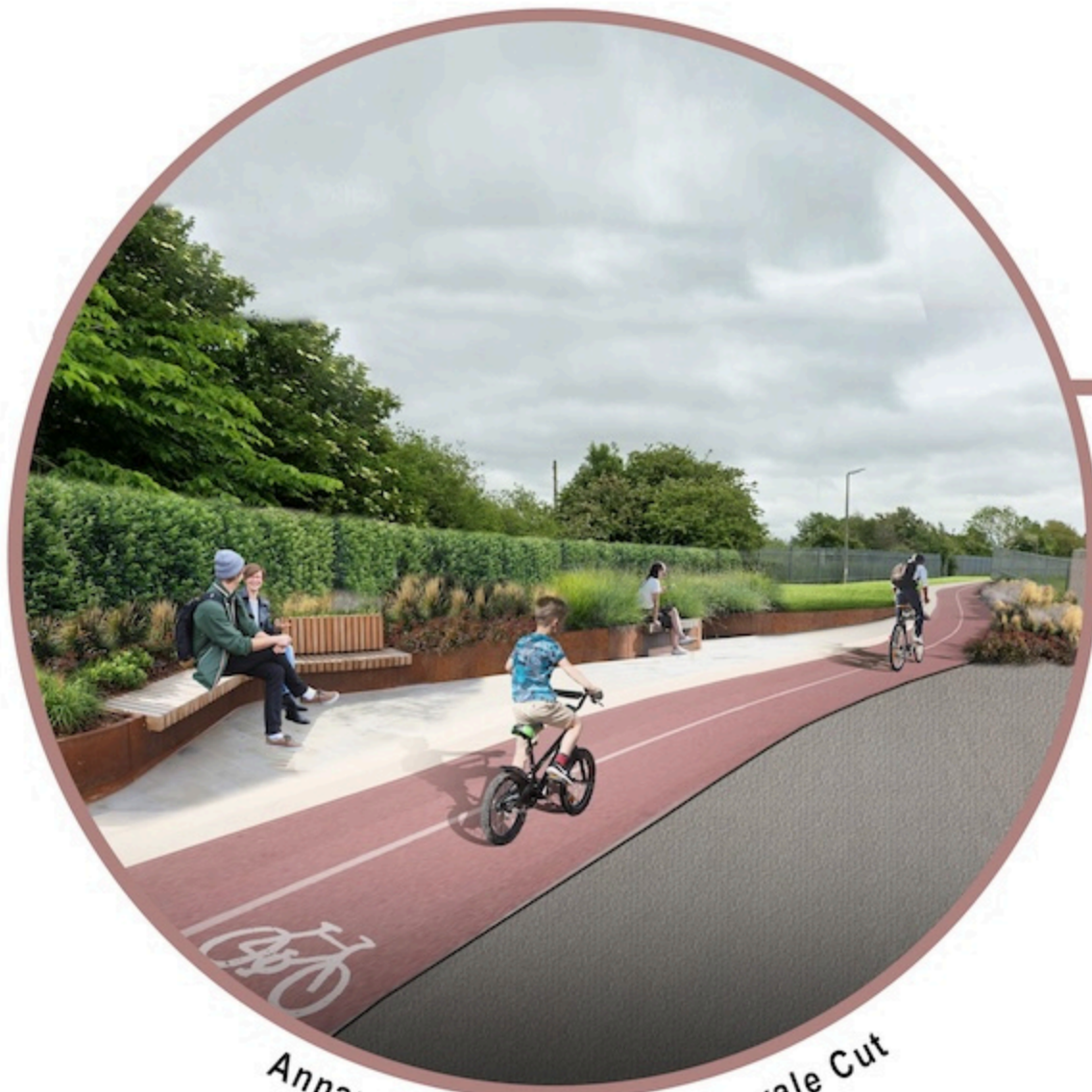
Annan Harbour route to Elmvale Cut