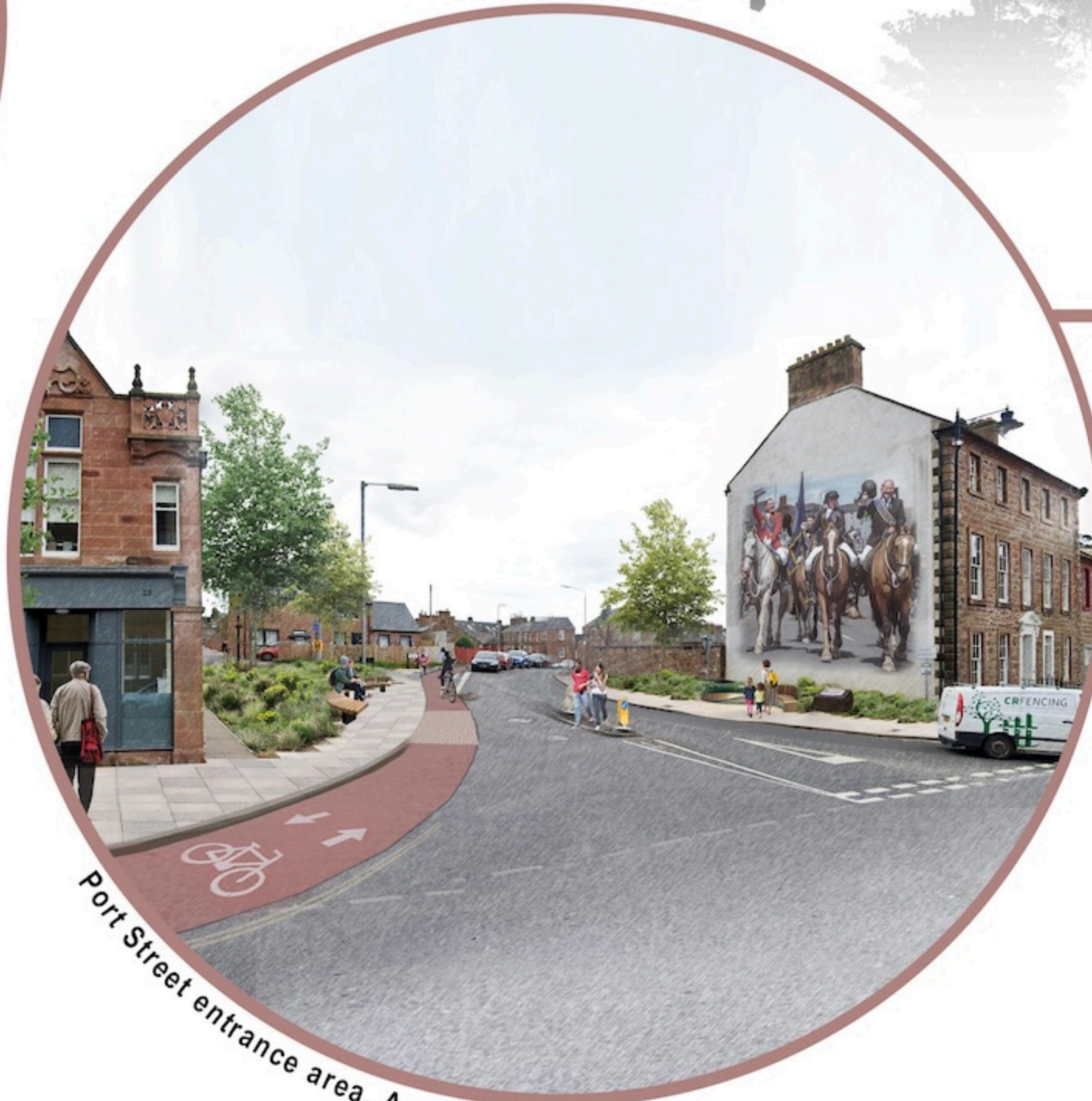
Port Street entrance area, Annan Town Centre