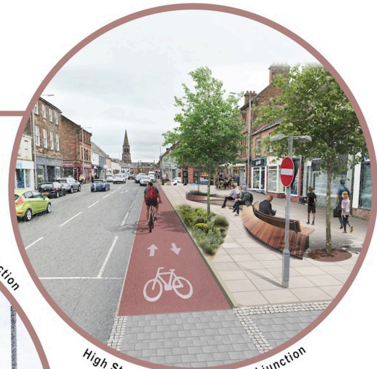
High Street and Butts Street junction