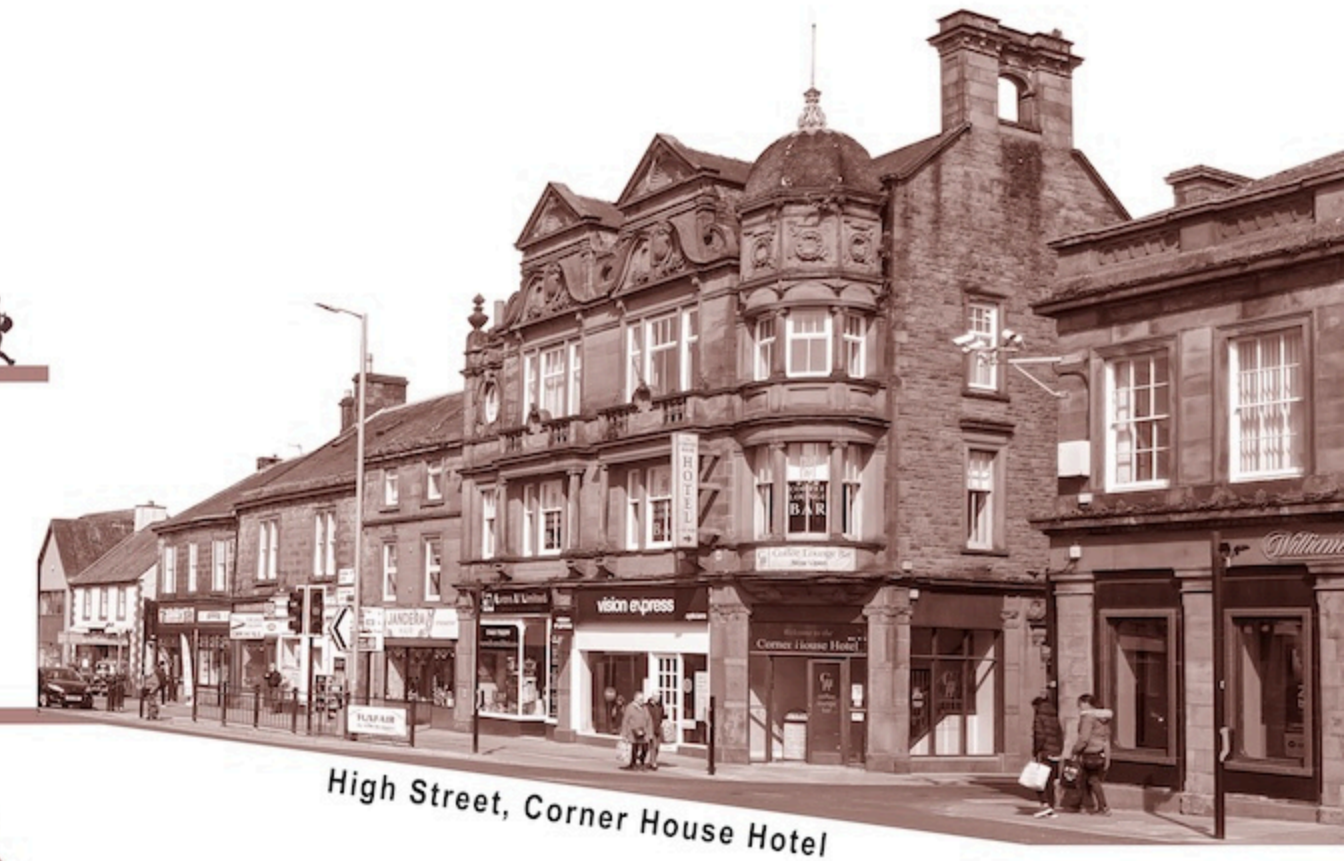
High Street, Corner House Hotel