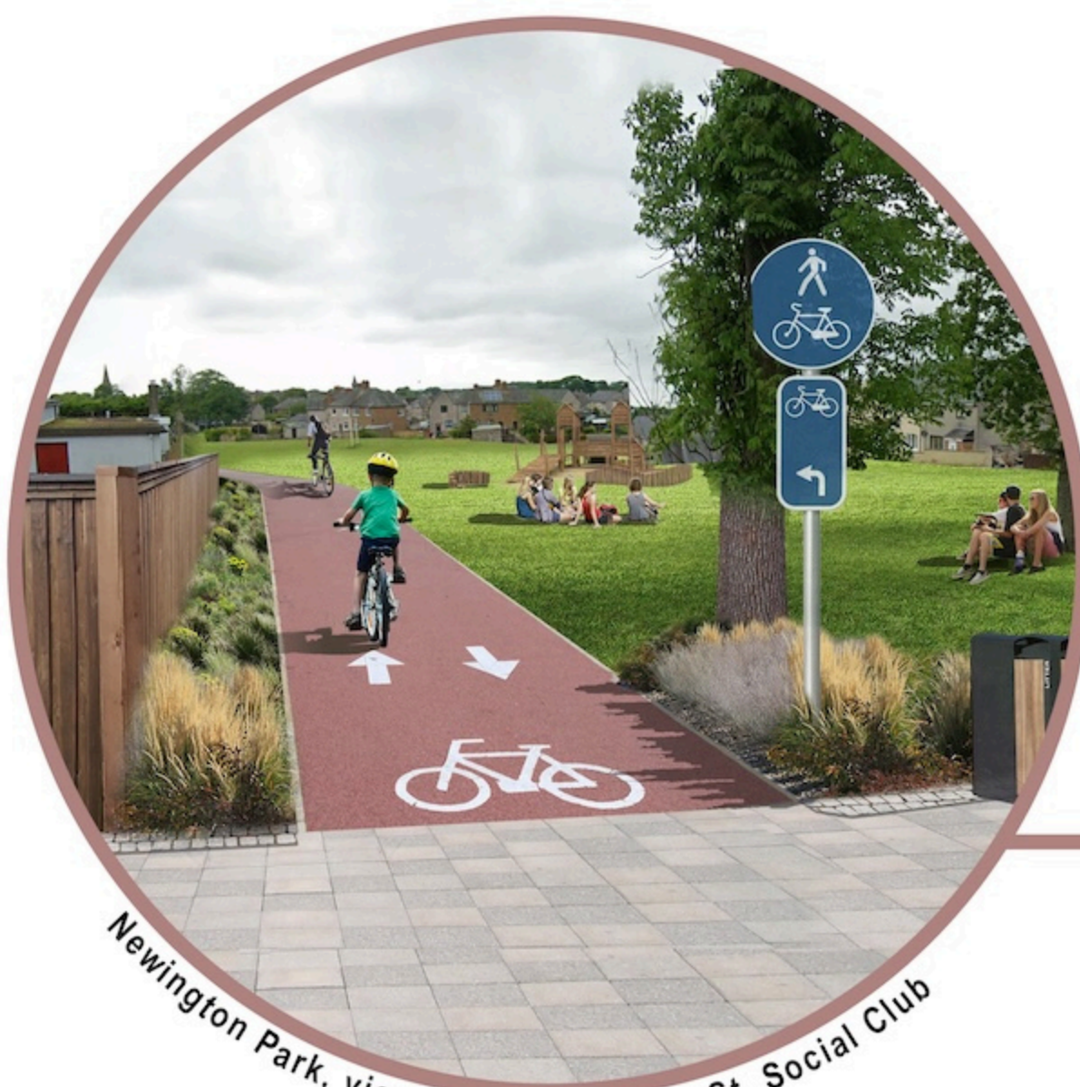
Newington Park, view from Standalane St, Social Club